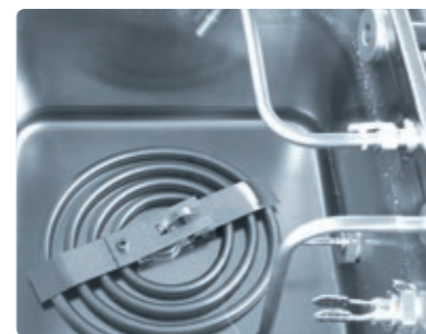
Feed water tank with degassing and level control independent of conductivity.