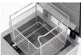
Baskets can be hung in and set up in the drip position