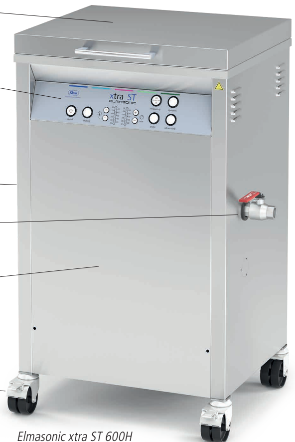
Elmasonic xtra ST 600H

High mobility , since devices are on industrial rollers