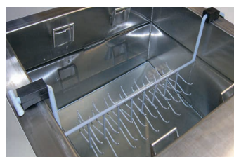
Product carriers for e.g. jewellery parts