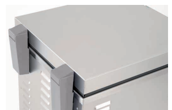
Hinged covers with noise protection