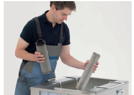
Industrial parts cleaning in workshops, production and servicing as well as for overhaul cleaning