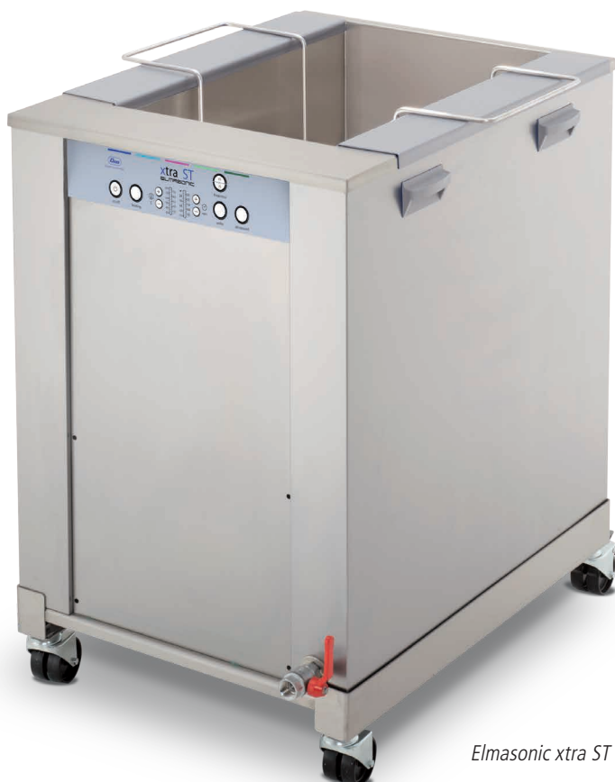
Elmasonic xtra ST 1900S