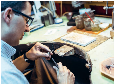
Cleaning in the jewellery industry (e.g. necklaces, earrings, bracelets, rings, etc.)

Elmasonic xtra ST devices are rated for continuous operation under the highest operational demands. The tanks are made of special stainless steel, which makes them robust with a long service life. In single-shift operation, they are guaranteed a warranty period of three years.