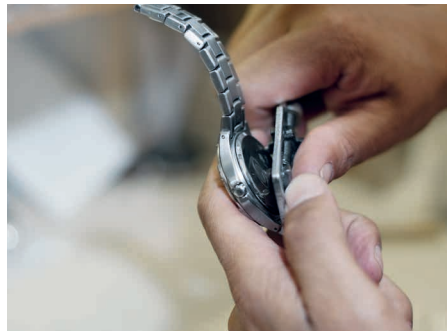
Cleaning in watch manufacture (e.g. bottom cases, watch straps, etc.)