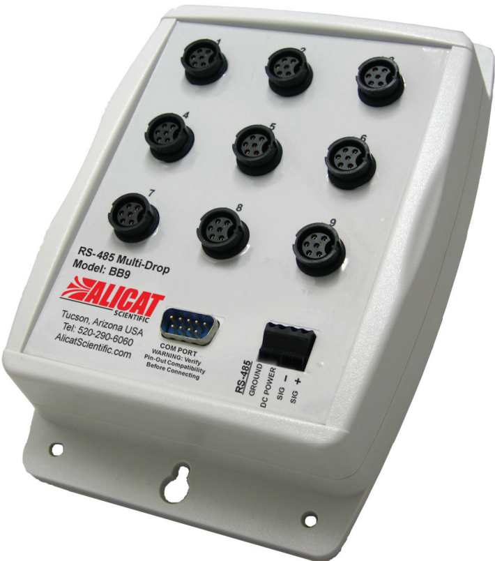
6 pin Locking Industrial Connector