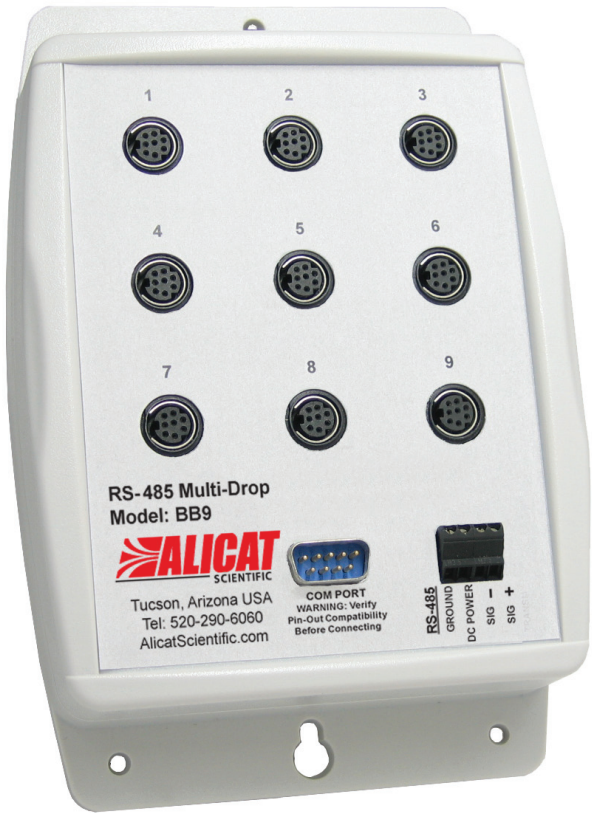
Standard 8 pin Mini-DIN Connector