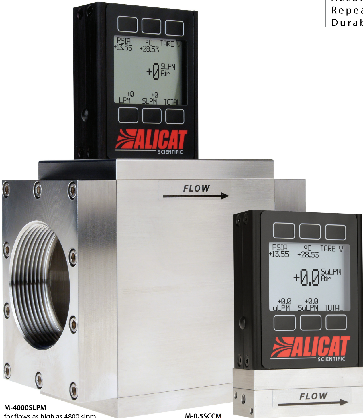
M-4000SLPM for flows as high as 4800 slpm