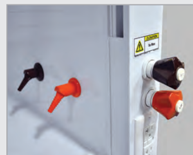
Dual wall construction allows for front mounting of services