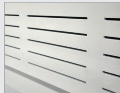
AirZone™ internal baffling provides even airflow for maximum containment