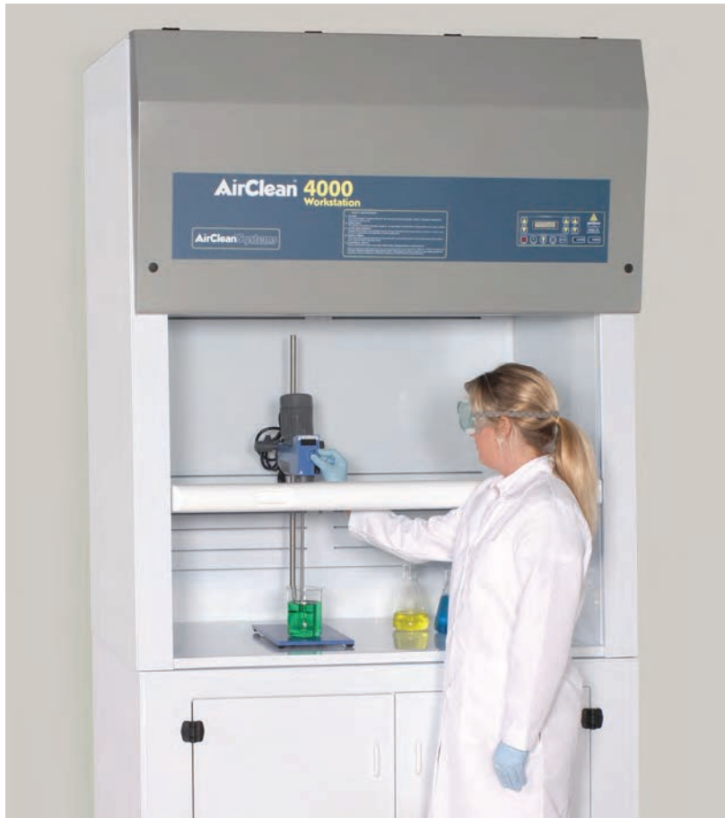
AC4000S Polypropylene Ductless Fume Hood with sliding sash, shown on optional base cabinet