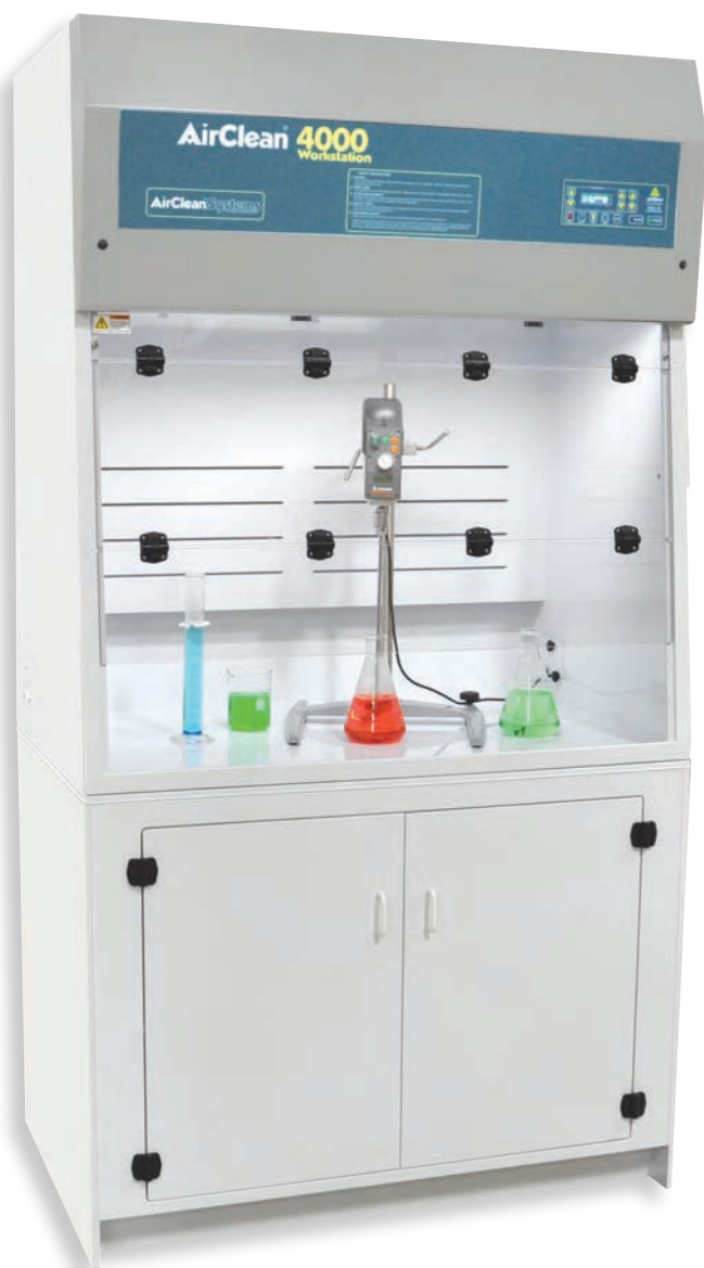
AC4000 Polypropylene Ductless Fume Hood shown on optional base cabinet

For the widest application range possible, each polypropylene hood is designed to accommodate up to seven inches of filtration. By stacking a HEPA filter followed by a bonded carbon filter, the operator can effectively filter both toxic particulate and chemical fumes. For high evaporation or multi-chemical applications, a full seven-inch stack of chemical filtration may be recommended.