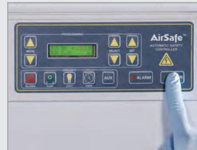
AirSafe™ automatic safety controller