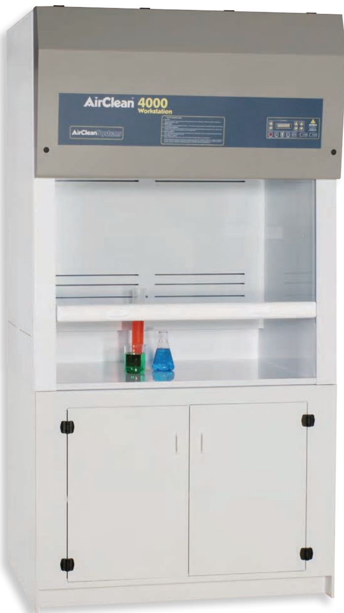
AC4000S Polypropylene Ductless Fume Hood with sliding sash, shown on optional base cabinet

AirClean® Systems polypropylene ductless fume hoods with vertical sliding sash are similar to traditional exhaust fume hoods, yet do not require costly ductwork and HVAC systems to eliminate toxic fumes, vapors and gases. Operators familiar with exhaust hoods feel at home thanks to the vertical sliding safety glass sash, dual wall construction, and optional front-mounted fixtures. In addition to these time-tested features, the AirSafe™ automatic safety controller provides constant airflow monitoring, automatically maintaining the operator-specified face velocity as the sash is raised or lowered.