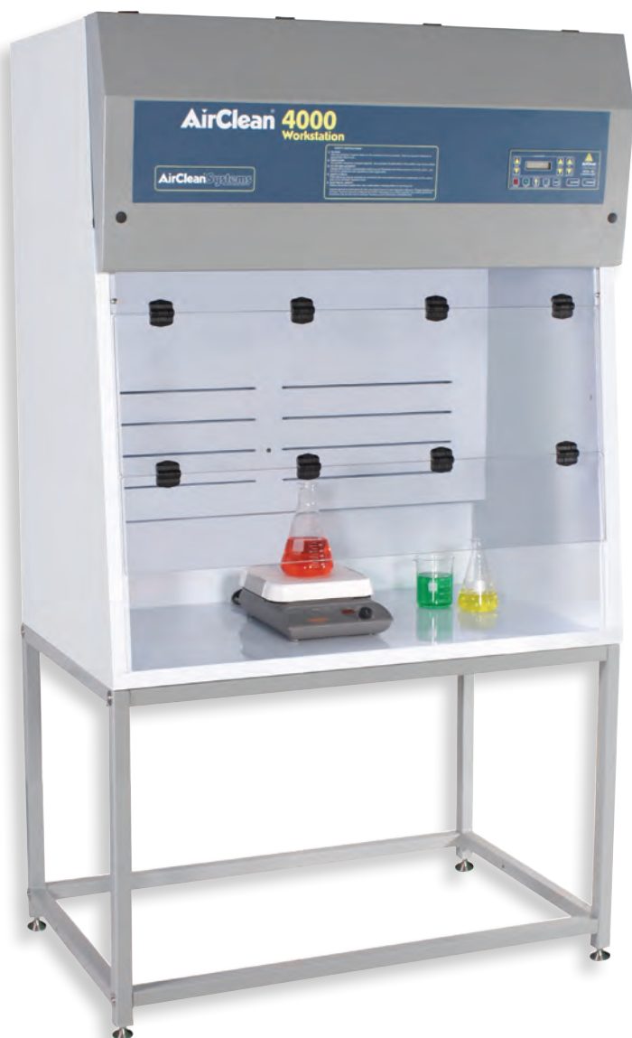
AC4000 Polypropylene Ductless Fume Hood on optional stand