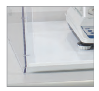
Solid 3/8" polypropylene base