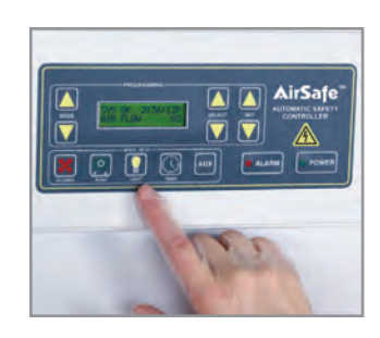
Real-time read-out of face velocity with precise airflow control and monitoring