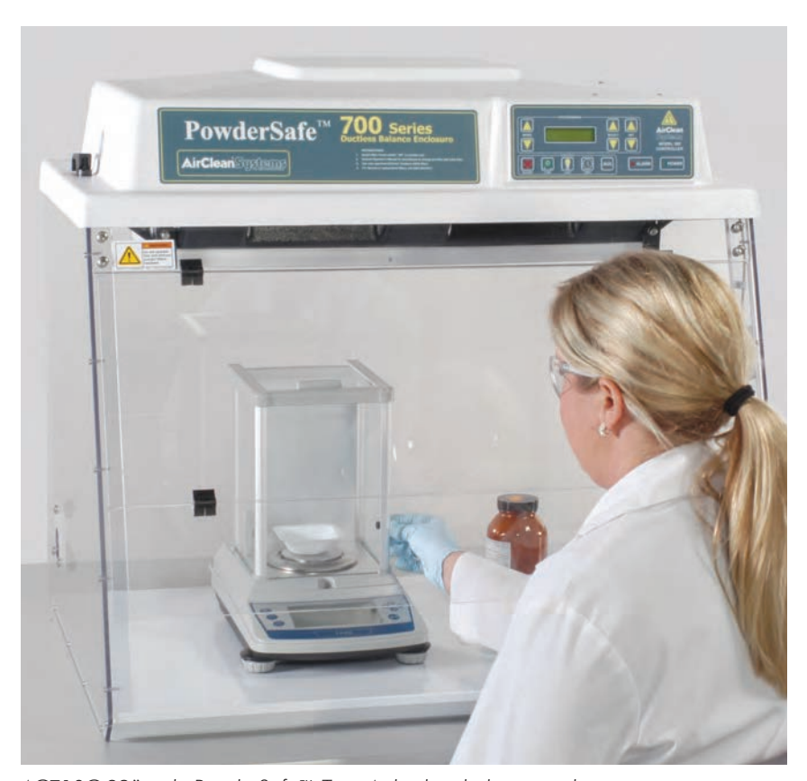
AC710C 32"-wide PowderSafe™ Type A ductless balance enclosure

PowderSafe™ Type A enclosures provide a safe and effective weighing environment for toxic compounds and/or liquid chemicals. Engineered specifically for balances, PowderSafe™ Type A enclosures protect the operator by capturing particulate in HEPA filtration without sacrificing balance stability. These compact, ductless enclosures are factory leak tested, certified and shipped fully assembled for simple installation on any countertop.