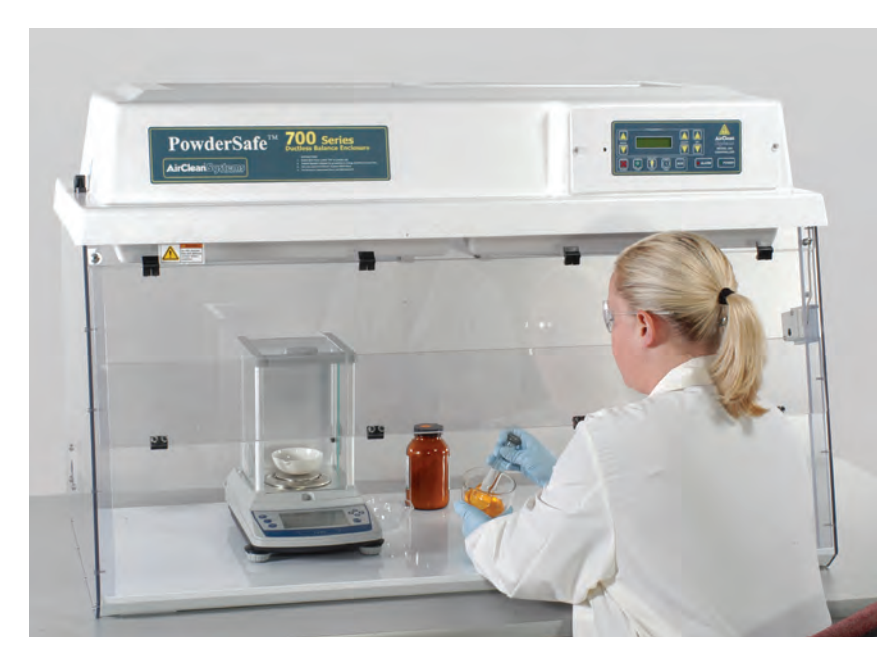
AC720C 48"-wide PowderSafe™ Type A ductless balance enclosure