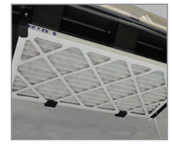
SafeChange™ technology allows for the pre-filter to be bagged-out while the enclosure is running