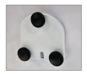
Electrical and utility cord access port