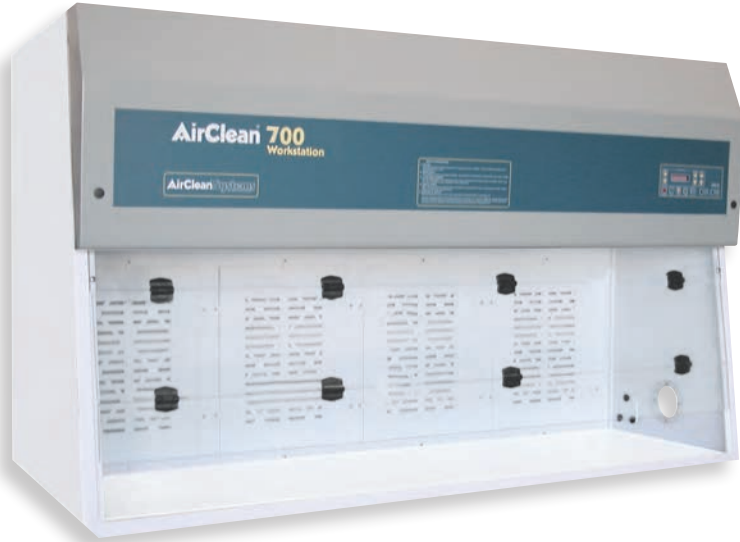
AC780 PowderSafe™ Type C with standard white base and disposal port. The disposal port minimizes operator exposure to residual powders left on used weighing vessels