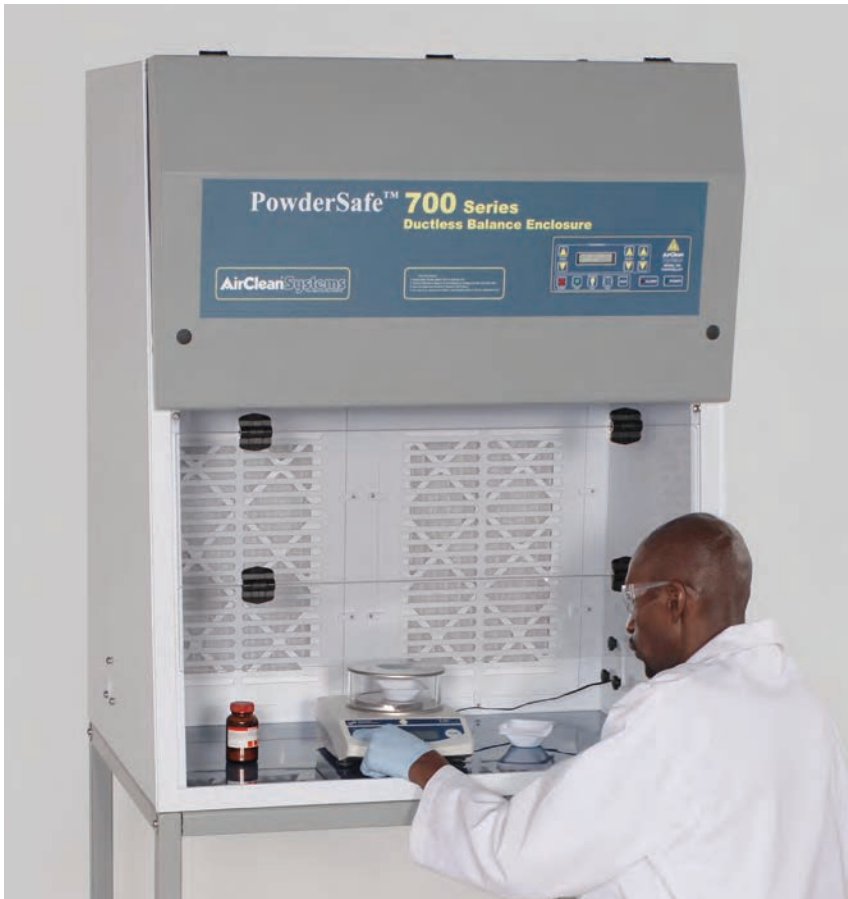
AC760 PowderSafe™ Type C shown with optional blue base and stand

AirClean® Systems Type C PowderSafe™ ductless balance enclosures incorporate the airflow dynamics and HEPASafe™ features of the PowderSafe™ Type B with the user-friendly features and chemical fume containment capabilities of an AirClean® Systems ductless fume hood. Thermally-fused polypropylene construction makes the PowderSafe™ Type C enclosure perfect for weighing powders or solvents.