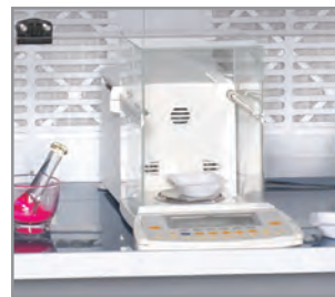
High mass polypropylene construction for balance stability