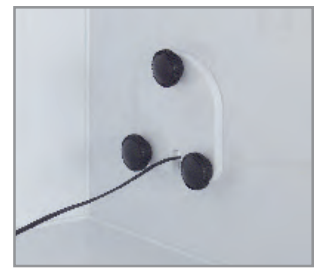
Electrical and utility cord access port