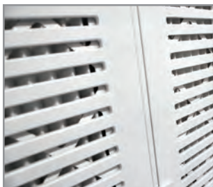
Rear wall filtration zone featuring HEPASafe™ filter change-out technology