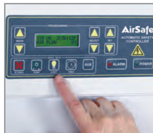
Real-time monitoring of face velocity and filter condition via AirSafe™