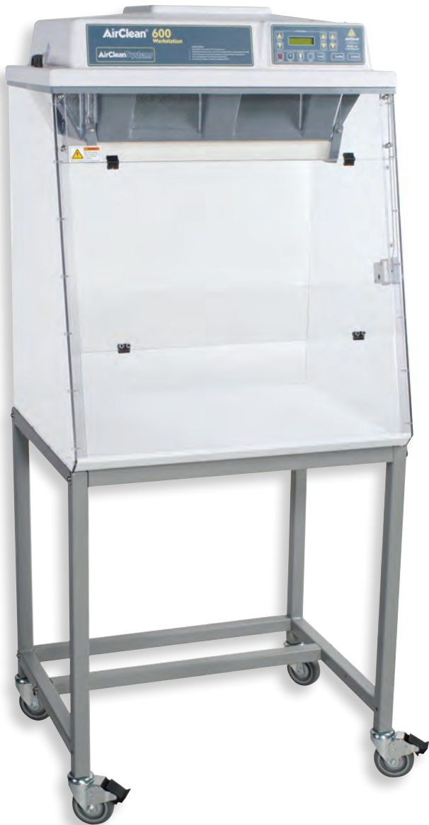
AC632TA Ductless Chemical Workstation with optional cart