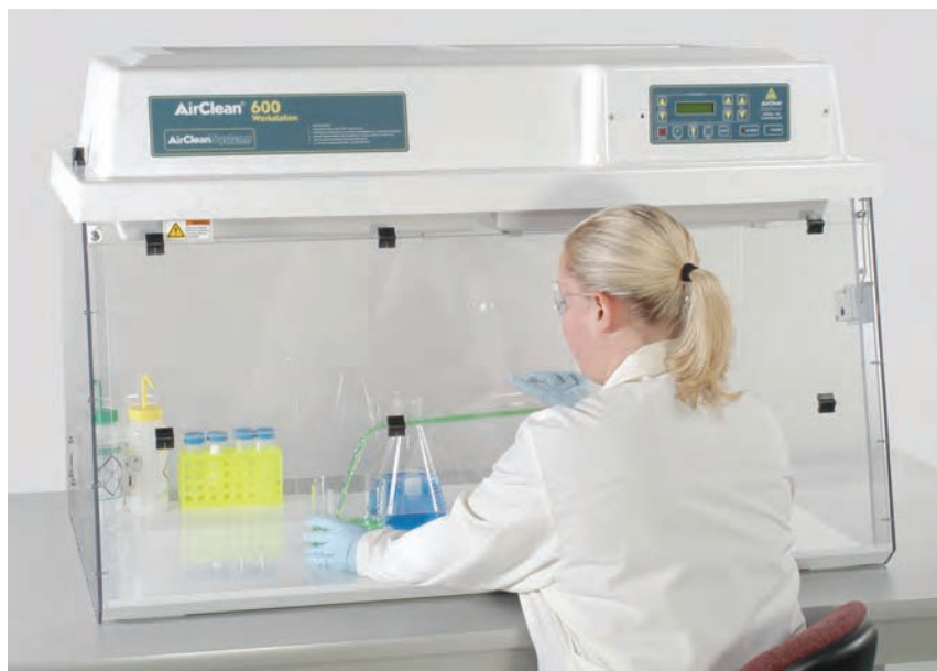
AC648A Ductless Chemical Workstation

AC600 Series ductless chemical workstations are a low cost solution for operator protection from toxic vapors, gases, fumes and particulate while performing low-volume applications with known chemicals. While smaller and more mobile than a standard ductless fume hood, AC600 Series ductless chemical workstations include the same advanced safety features and technology as larger AirClean® Systems ductless hoods: gas phase bonded carbon filtration, real-time gas detection and constant airflow control and monitoring.