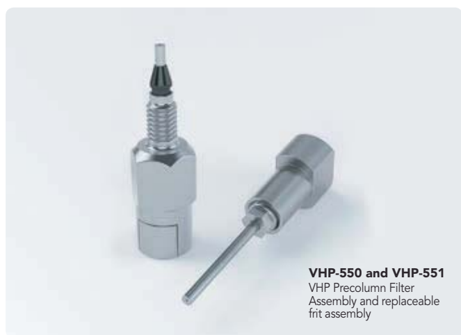
VHP-550 and VHP-551 VHP Precolumn Filter Assembly and replaceable frit assembly