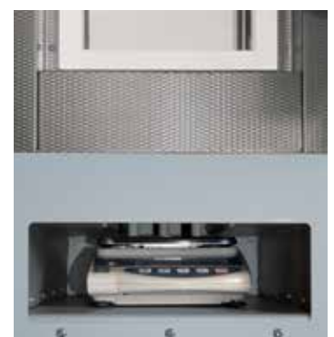
HT 16/17SW with scale to measure weight reduction during annealing