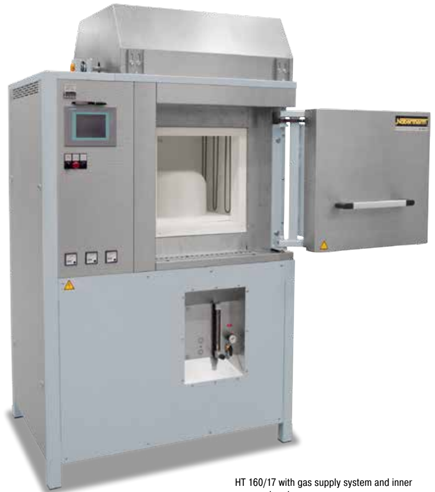
HT 160/17 with gas supply system and inner process hood