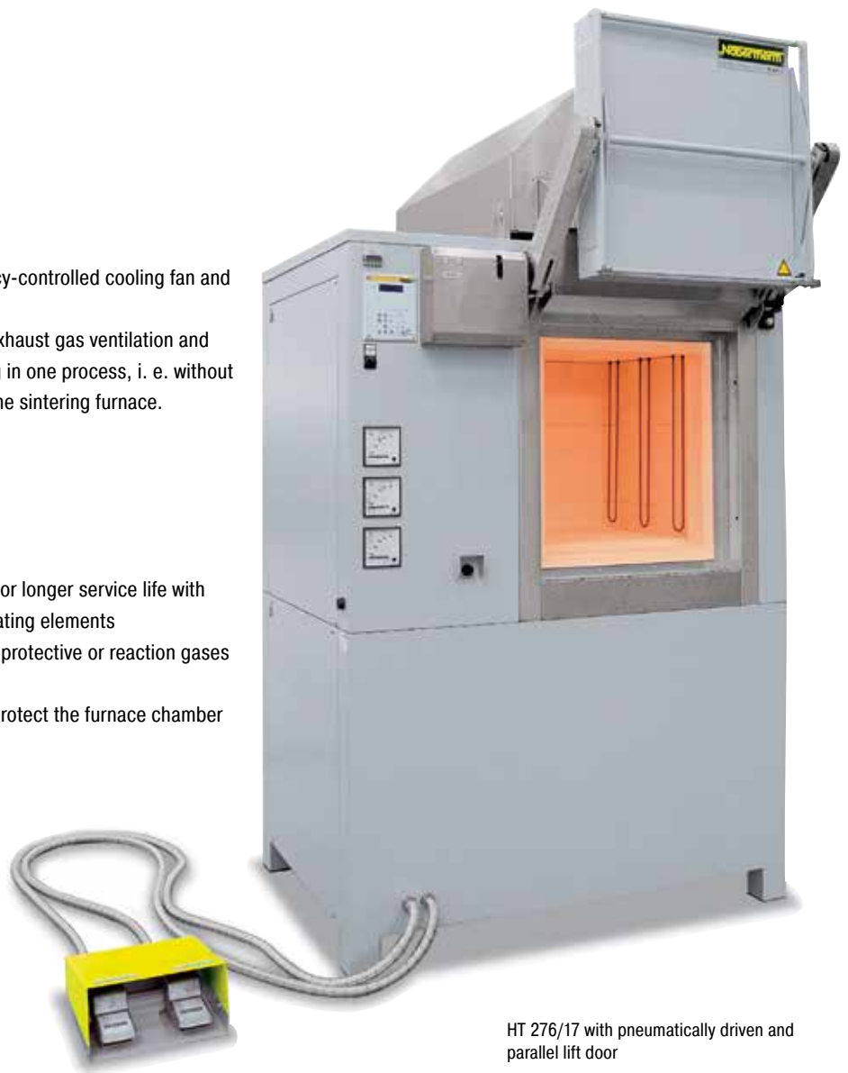
HT 276/17 with pneumatically driven and parallel lift door