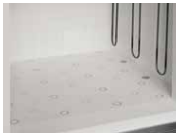
Reinforced floor as protection for bottom insulation HT 16/16