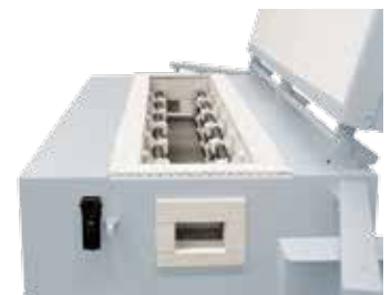
Furnace chamber of the GR 1300/13 with second door as additional equipment