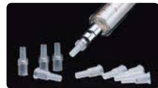
B-100 and B-101 Disposable Sample Filters

These Disposable Sample Filters are designed to remove particles from analytical HPLC samples. The polypropylene holder incorporates a 1/32" thick, 1/8" diameter stainless steel frit, which causes very little back pressure. To use, just attach one of these filters onto the end of any standard luer syringe, such as our B-310 found on page 155.