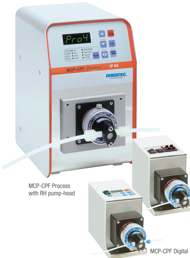
MCP-CPF Process with RH pump-head