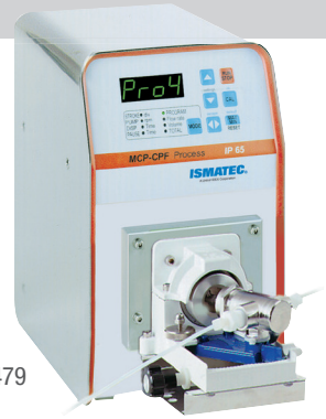
MCP-CPF Process with Q pump-heads and Low Flow Kit R479